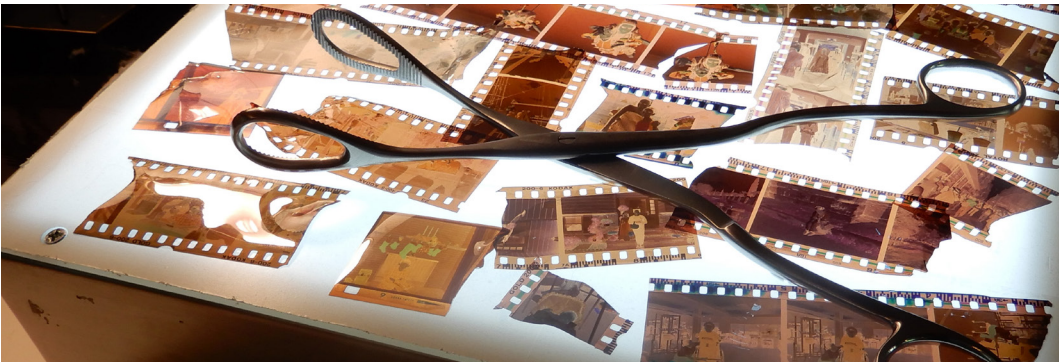
Medium: Mixed media sculpture (lightbox, photo negatives, and Sopher forceps)

Sopher forceps are used in dilation & evacuation abortions to dismember second-trimester children in the womb. For this piece, they have been used to tear apart photo negatives. “Dilation & Evacuation” invites viewers to reflect upon how abortion destroys entire lifetimes, and all the Kodak moments that would have been; look closely and you will see a wedding, birthday, first day of school, skydiving, and more. Inspirations include the future-like-ours argument and the Polaroid analogy. The Sopher forceps are firmly glued to the lightbox so they can never harm a child; once intended as an instrument of death, they now communicate how devastating abortion is for the victim and all of society.